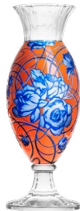
vase / engr. Peonies crystal overlaid with blue and with orange enamel 16.4 × 50 cm 51191 unique piece

The trio of vases, each of which is the only specimen of its kind, follows up on a cycle of vases with Alphonse Mucha's floral motifs. Through it, Moser celebrates this year's 160 th anniversary of the artist's birth. The vases stand out by their singular colour combinations as well as by their motifs, which focus on the chosen flowers without Mucha's female figures – including the unusual, bewitching durman. Being one of a kind, these vases make for excellent collector pieces.