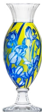
vase / engr. Irises crystal overlaid with blue and with yellow enamel 16.4 × 50 cm 51192 unique piece