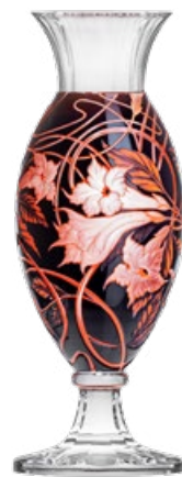
vase / engr. Durman crystal overlaid with orange enamel and blue 16.4 × 50 cm 51190 unique piece

Width (upper rim) × height (cm). Any slight deviations in dimensions or colour are evidence that items are handmade by our master craftsmen. We are available and happy to answer any enquiries for more information.